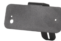
274-DLXT-T Trunk mounting