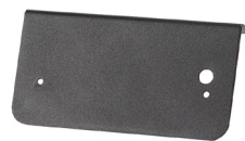
274-DLXT-U L-bracket for universal mounting