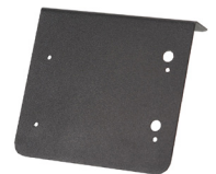
274-DLXT-2X1 L-bracket for mounting two single bezel series LED lights vertically