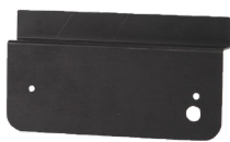
274-DLXT-W Window mounting